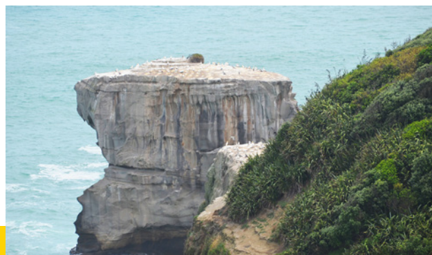
Gannet Colony, Muriwai