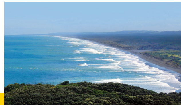
West Coast of North Island