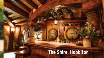
The Shire, Hobbiton