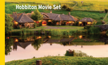
Hobbiton Movie Set