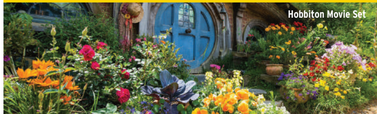
Hobbiton Movie Set