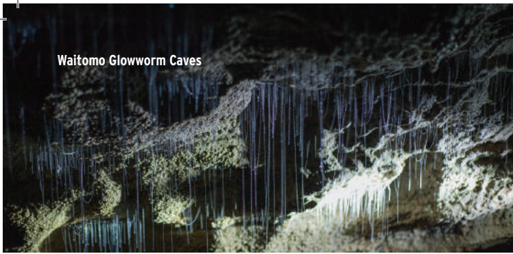
Waitomo Glowworm Caves